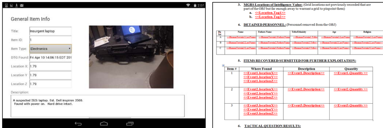
Figure 4. The information from the Annotate Item [Function 1.4.2] form (left) helps populate the SOF-SE Markup (right)

The application is implemented on a 7 inch Google Tango tablet. The Google Tango tablet includes a 3D depth camera that allows for precise motion capture (within 1 cm) of the tablet as the user navigates around a site. This provides the ability to include the relative position of photographed objects within a detailed map of the SE scene. The Google Tango also provides a 3D scanning capability that will allow for collection of geometric point clouds for portion of the SE room and objects collected. This 3D scanning data can be stored and archived as part of the system. However, a problem was encountered in which the Google Tango was unable to conduct depth sensing and capture pictures simultaneously. This was a problem because the Tango’s color camera is primarily used for depth sensing. If a picture was taken with the color camera, all 3-D aspects of the Tango would be interrupted. To solve this problem, another iteration of the SDP was conducted. It was decided to incorporate a second camera, a GoPro 4, into our design. Whenever the Tango drops tags during depth sensing, it sends a signal to the GoPro to capture a photo of where the tag was dropped and stores that photo.