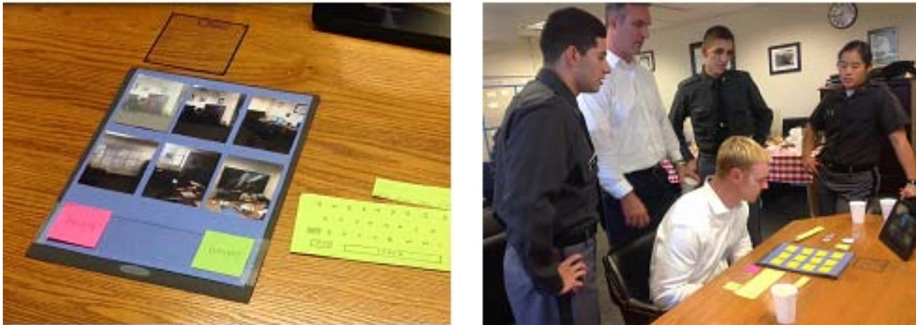
Figure 3. The Raven Eye Low Fi Prototype (left) being reviewed by Site Exploitation Subject Matter Experts (right)

user on the screen. Paper virtualizations of Raven Eye were created to simulate the flow of a SE mission. The early construction of the Lo-Fi design was extremely useful in working with SE Subject Matter Experts (Figure 3, right) highlighting user interface requirements for Raven Eye such as audio/video capture modes, data review, and the storage of captured information. Raven Eye must be intuitive and easy-to-use in order to allow the user to efficiently and effectively conduct SE missions.