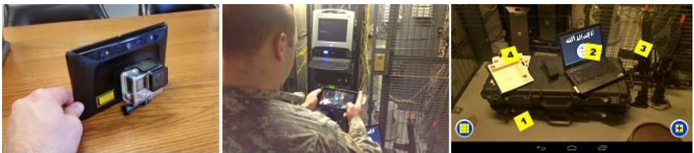
Figure 1. The Raven Eye system (left) is used by a soldier (center) to exploit a sensitive site. A screen capture from the system (right) shows tracked, virtual tags (yellow numbers) which annotate and geo-locate items of interest as the soldier navigates the scene.

Site exploitation (SE) is a critical mission for operators on the modern battlefield. However, the execution of a thorough SE takes a significant amount of time. Prolonged search and inventory activities place operators and their primary mission at higher levels of risk. Likewise, incomplete or incoherent site inventories can delay analysis of site artifacts and data, reducing the potential intelligence value of exploitation. Specific challenges include: