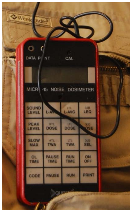
Figure 2. Quest Electronic Micro-15 Noise Dosimeter

run to ensure complete accuracy of the collected data. The 2012 data was gathered with the Micro-15 Dosimeter concealed within a clutch purse, with the microphone clipped as close to ear level as possible to mimic actual sound exposure. All 2014 data was gathered with the Micro-15 Dosimeter tucked in the pocket of the experimenter's pants with the microphone being clipped to the lapel of the shirt collar. For each run, the Micro-15 Dosimeter provided an accurate run-time which could be reutilized as the "exposure time" of the particular data point. Each run was recorded in an electronic notepad within the experimenter's cell phone and were later transferred to Microsoft Excel.