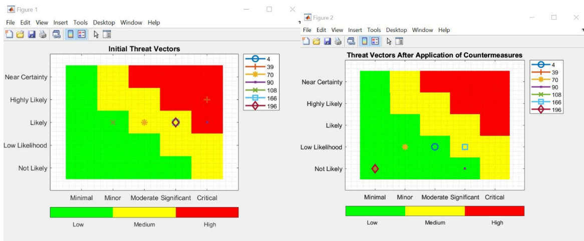
Figure 2. Generated Risk Matrices