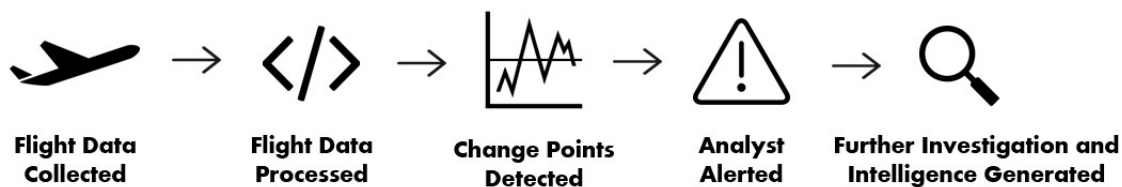
Figure 1: A High-level methodology for an OSINT tool using flight frequency data.

Figure 1 illustrates a high-level view of the methodology. The first step is to collect (or continuously monitoring) flight data from OpenSky API. Next, we process the data and run a Bayesian changepoint analysis to detect potential anomalies. Any anomalies create alerts for intelligence analysts to further investigate, eventually providing actionable intelligence. The remainder of this section will describe the data collection, data transformation, and changepoint analysis in greater detail. The authors will not attempt to describe the steps after a potential anomaly is detected as these will be highly dependent on doctrine and organizational differences of the users.