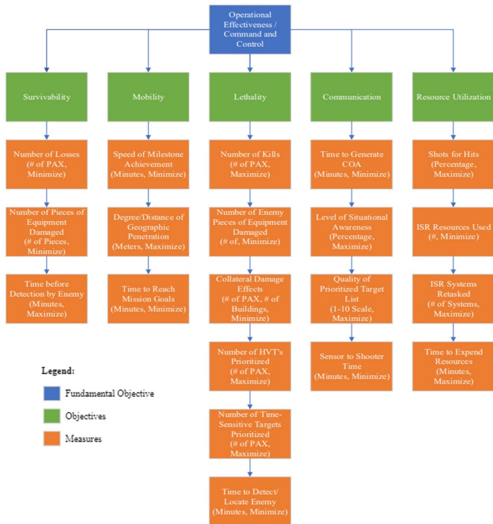
Figure 2: Functional Hierarchy Diagram